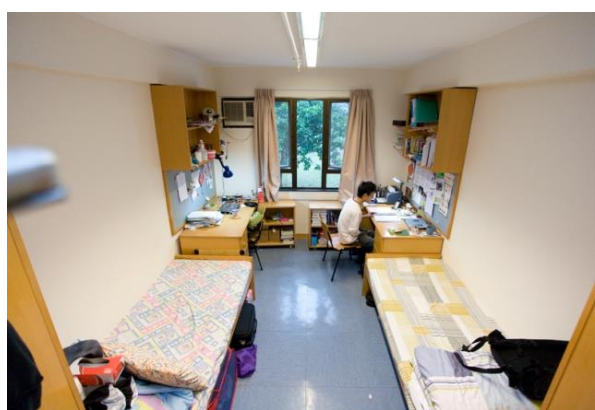
伯利恆宿舍二人房間 BH 2-bed room