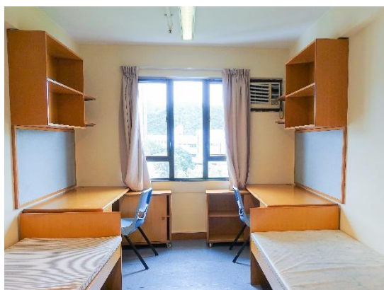
伯利恆宿舍二人房間 BH 2-bed room