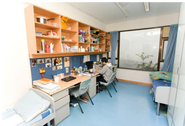
湯若望宿舍三人房間 ASR 3-bed room