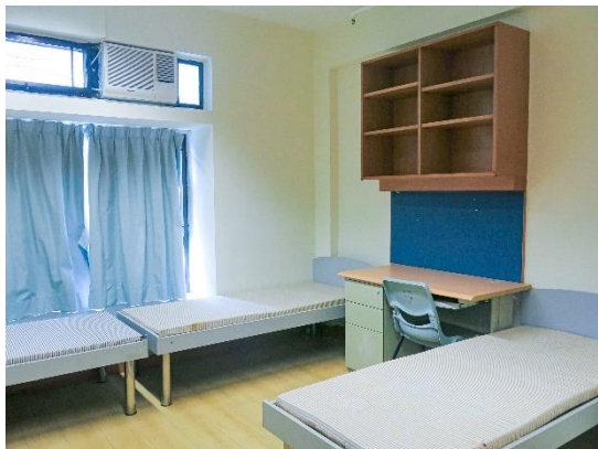
湯若望宿舍三人房間 ASR 3-bed room