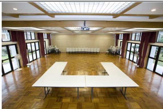
(H1) 湯若望宿舍禮堂 Hall at Adam Schall Residence